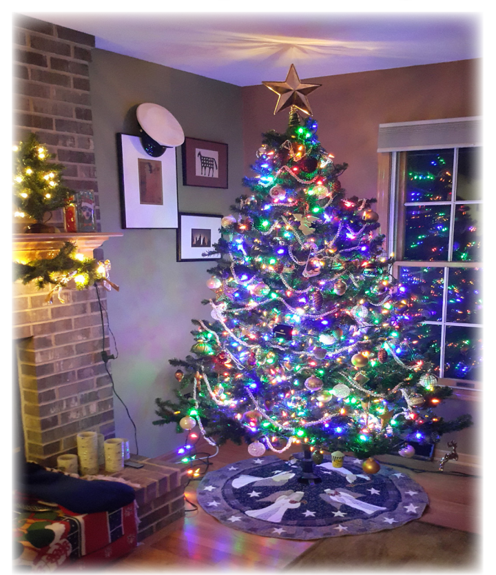
The 26th of November marked a really special day for the Americans; is called Thanksgiving. It is an event to celebrate in the fourth Thursday of November each year and means a lot to my host parents and of course to Americans.

My host dad, for example, emphasizes the fact that it is not only a time for the family to meet together again but also an opportunity to think about all the things we are grateful for. During Thanksgiving, the whole family (host mom's side) got together and we ate turkey which is the traditional meal with mashed potato with gravy, in a