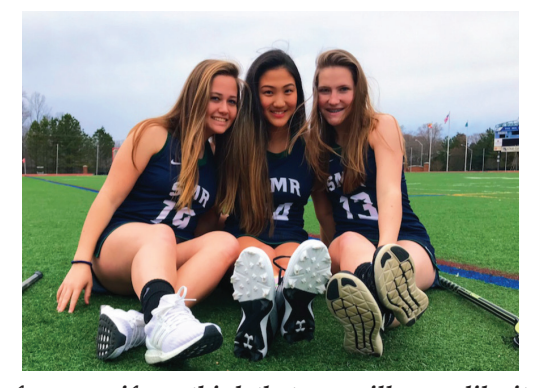
done before even if you think that you will never like it. If you try and do not like it, now you know for sure and you at least will not regret not trying it, but you might find a new hobby or something that you absolutely love!