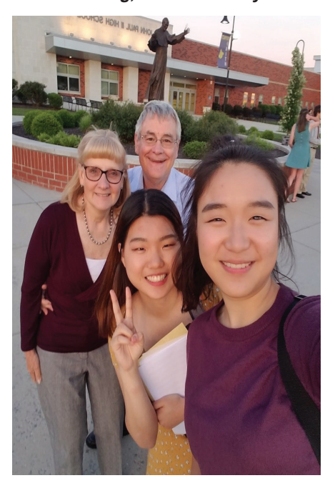
everything will be fine. And most of all, congrats, Seniors!!!

Having the word "last" always gives me a strange feeling. It gives me the feeling that there are no other upcoming things after this. However, I always try to remind myself that "last" is another word for "start." I'm pretty sure that there will be so many high school seniors out there, who are confused between the big change from high school to college. As one of the seniors who is going through the exact same thing, I want to tell you that